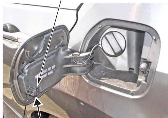
FUEL DOOR LOCK TAB