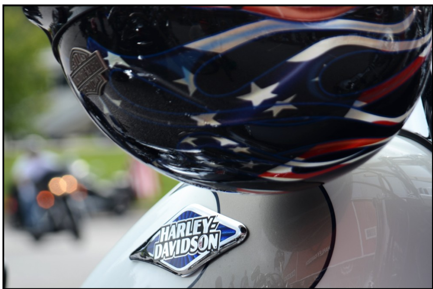
Stars 'n' Stripes Helmet

As a tribute to Patriot Day, Chesapeake Harley Davidson teamed with McAvoy's in Parkville for the 2012 Patriot Day Ride on Sunday, September 9th. More than 100 bikes participated in the ride from Darlington (near Conowingo Dam) to Parkville.