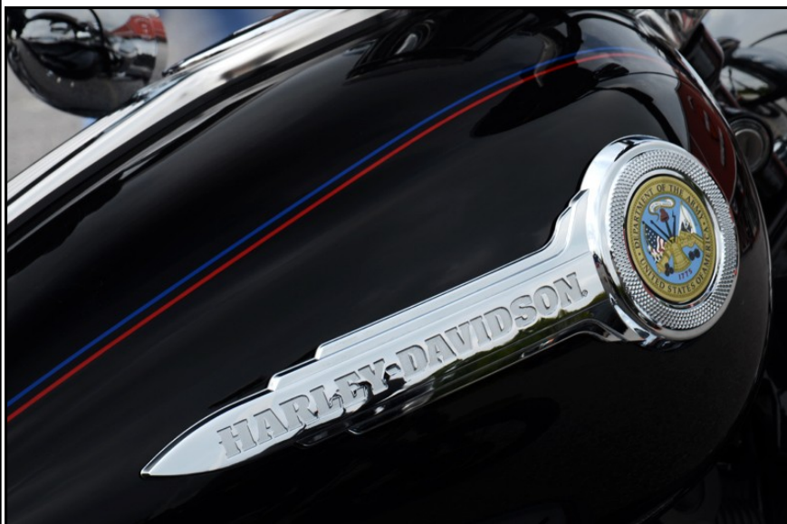
Black Tank

As the group was gathering, there were tributes to those who lost their lives that fateful day eleven years ago. Moments of silence were held at the time of each airplane crash and when the two World Trade Center towers fell.