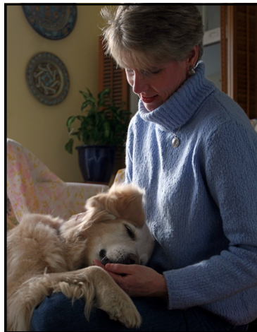
Best Friends 1st—Print Novice Color