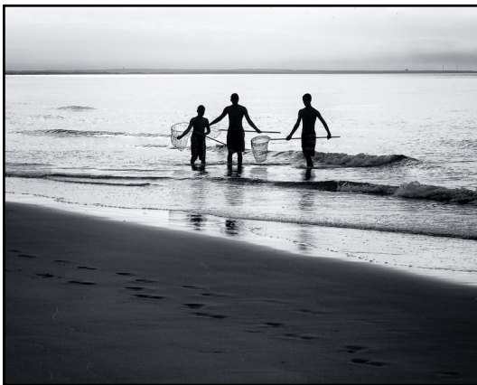
Boys With Nets 1st—Print Unlimited Monochrome