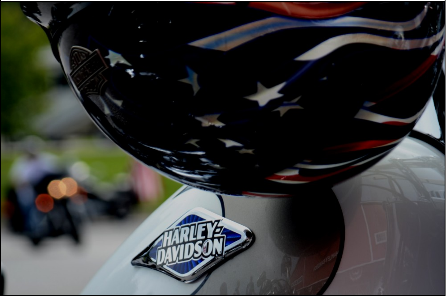
Stars 'n' Stripes Helmet © Jim Eichelman