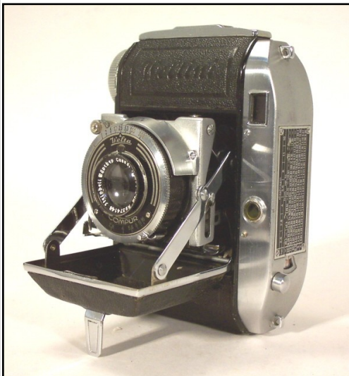
Image 2: Welta Weltini from 1940 with a 50mm f/2.8 Steinheil Cassar lens.