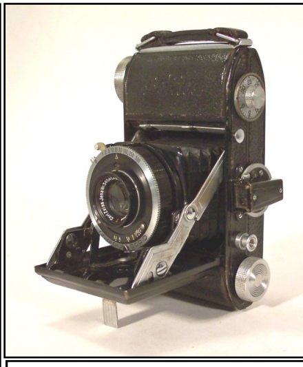
Image 3: Balda Baltica from 1935-39 with a 50mm f/3.5 Zeiss Tessar lens.