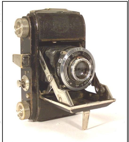
Image 1: Welta Weltix from 1939 with a 50mm f/2.8 Steinheil Cassar lens.