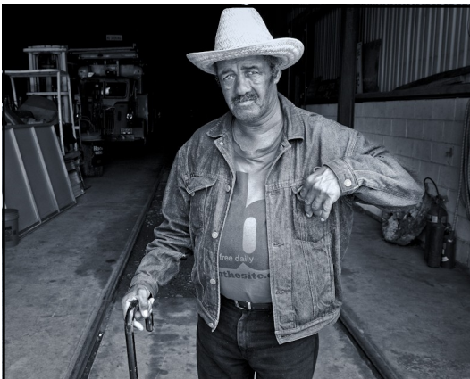
b © Rebecca Rothery 1st—Digital Novice