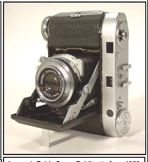
Image 4: Balda Super Baldinette from 1952 with a 50mm f/2.8 Schneider Xenar coated lens.