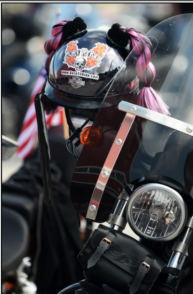
Born To Ride