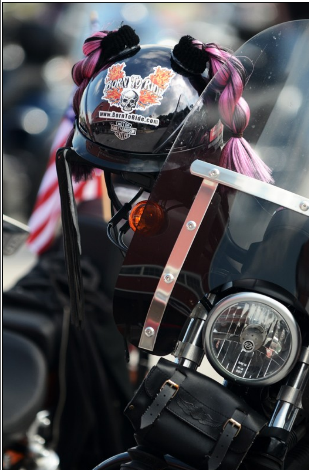
Born To Ride