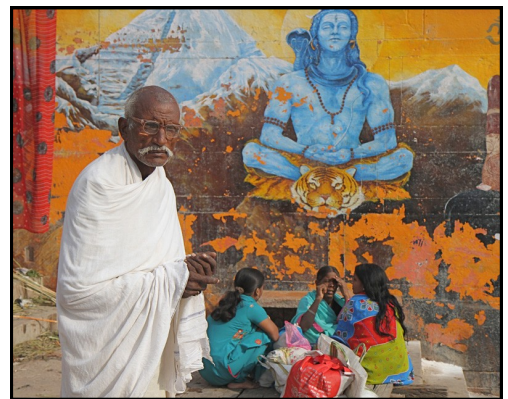
A Man From Varanasi © Joan Saba 1st—Print Unlimited Color