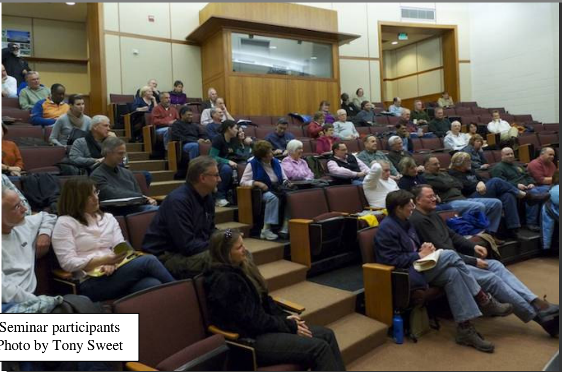
Seminar participants