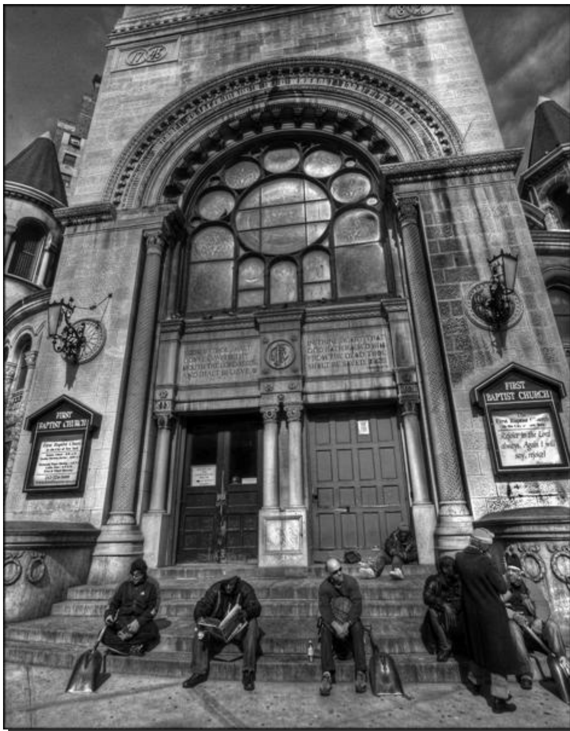
The Invisible Homeless Man