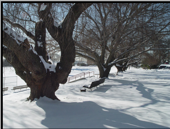
Cherry Trees In The Snow