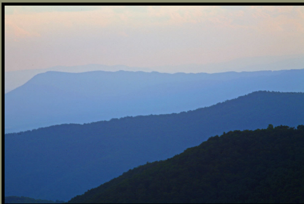
Blue Ridge Mountains, You bet!