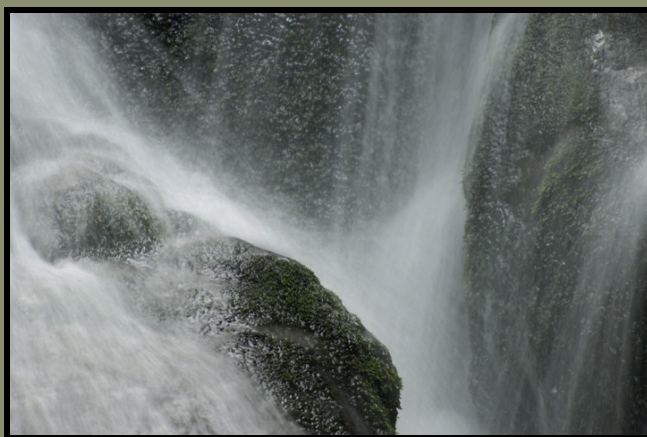
Waterfalls, waterfalls, waterfalls! Karen zeroed in on the splash.