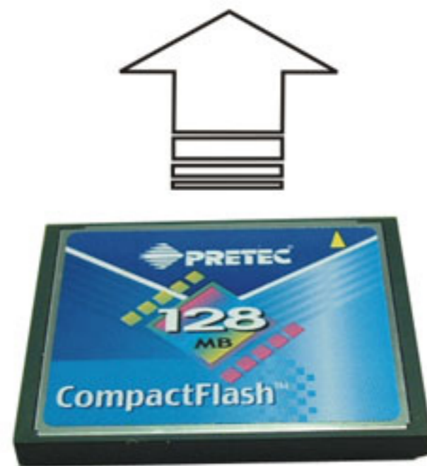
Compact Flash Card