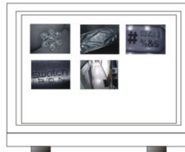
Display 9 Grids with Equal Size