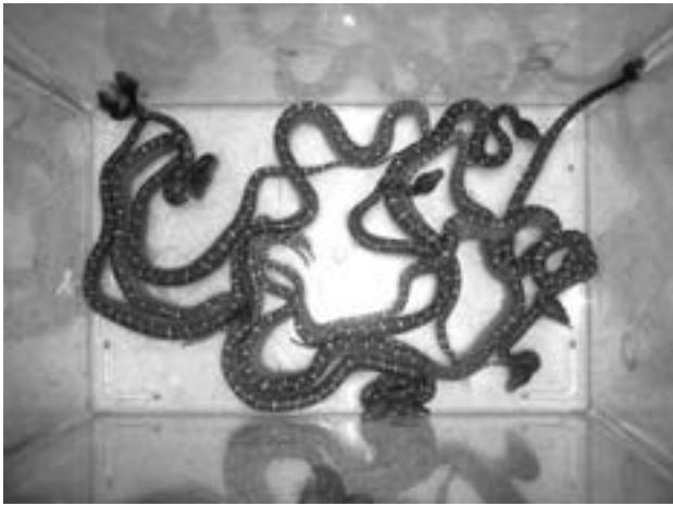
A litter of neonate Corallus caninus .

polyandry as a form of insurance against genetic incompatibilities. One study of a colubrid snake showed that females that practiced polyandry and subsequently produced multiple-sired litters, retained greater postpartum body weight and delivered larger overall litters. A less scientific personal observation suggests that not all males are created instinctually equal. In essence, it takes two to tango, and, if one of the dancers is unwilling, being able to call in an understudy may well increase the likelihood that the show will go on.