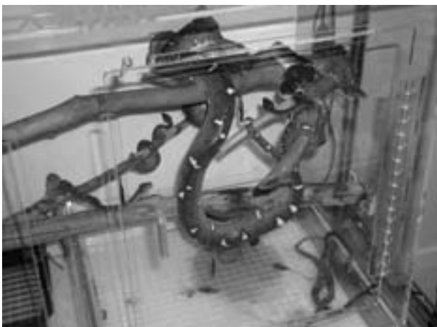
Parturition is frequently a messy affair in this live-bearing species.

Litter sizes average between eight and eleven (as few as 1 and as many as 22 have been recorded) and newborns should be active and, in the best case scenario, have no sign of an external umbilicus. Neonates should be gently wiped clean of amniotic fluid using a damp paper towel and clear 75 °F-tap water, and subsequently placed in small individual containers, supplied with a water dish and a perch no greater than 5/8" in diameter. Most babies will enter into a shed phase within two weeks of birth. Keepers should resist the urge to feed newly shed babies, as it takes as long as 30 days for a baby to deplete its supply of internal yolk. Two weeks after the initial shed, feeding trials can begin. Most breeders prefer to begin trials employing thawed pink rats that have been repeatedly dipped in hot water until they register a temperature of 115–120 °F, a process I refer to as "superheating." My preference is to use live Siberian Dwarf Hamster crawlers (approx. 8 g). To date, this method has never failed to inspire neonate emeralds to do what nature intended. Their suitability for this task is unsurpassed in my experience and, when