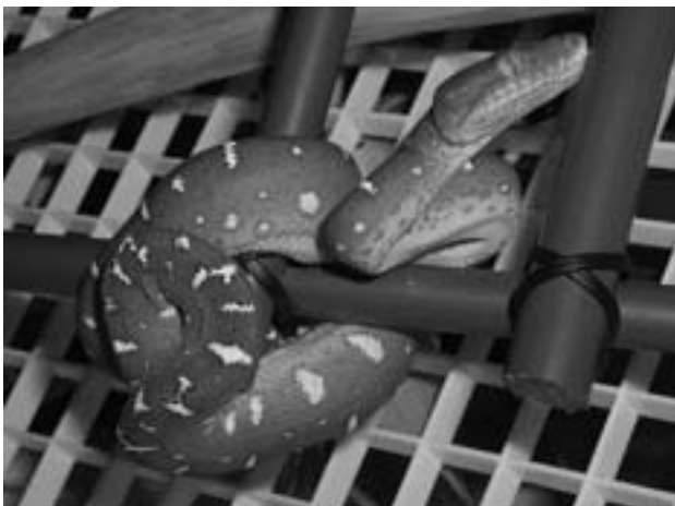
Neonate Corallus caninus vary in color, but the green adult coloration appears only later.

Both temperature cycling and pair-rotation should be continued for as long as breeding activity is observed. However, actual breeding behavior may not be observed or recognized. In such instances, breeding trials should be continued throughout the season. One additional environmental stimulus reported to be effective at virtually any time of year is direct exposure to a drop in barometric pressure, such as those that often precede the onset of a thunderstorm. Such exposure is commonly reported to evoke immediate breeding responses from males that had previously been