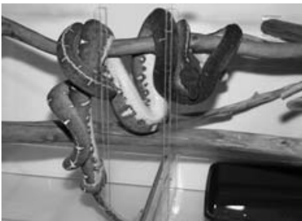
Corallus caninus copulation.

The use of multiple males in breeding (polyandry) is believed to be beneficial. The presence of competitors may increase testosterone production levels, thereby augmenting instinctive breeding behavior. Females may instinctively embrace