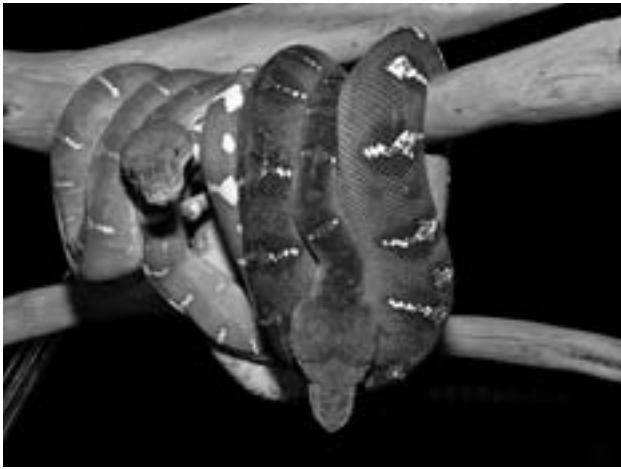
Breeding behavior in which the pair is tightly intertwined is called "cuddling."

dration. In these instances, a large flat dish containing no more than 1/4" of water can be introduced. Newborn emeralds not fully broken free from their egg sacs at birthing may be inadvertently dropped into water bowls and subsequently drown.