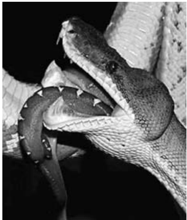
An Amazon Basin female eating a still-born neonate.