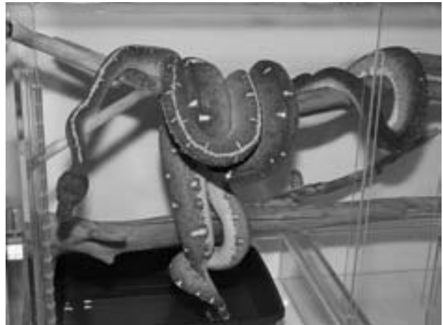
Breeding behavior known as "barber-poling."

slow to respond or shown little interested in breeding. I have personally observed virtually every sexually mature male in my colony begin cruising and scent-marking his perches at such times.