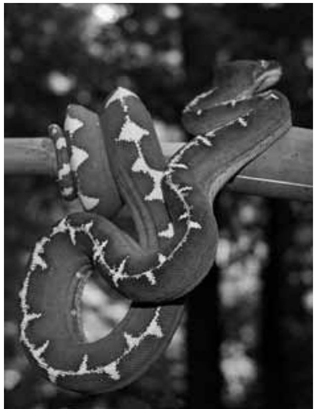
The extent, continuity, and pattern of white markings in Corallus caninus vary considerably in different parts of the species' natural range (see also Iguana 12:2–7).

In nature, Emeralds are exclusively arboreal primary rainforest dwellers that thrive within a relatively narrow range of conditions. Until recently, this combination was quite challenging to recreate within a captive environment. Maintaining moderate ambient heat, high relative humidity (RH), and continuous air circulation was difficult enough, but attempting to balance these elements to within the specifications of a Neotropical rainforest habitat have traditionally proven all but impossible for the average herpetoculturist. As a result, even today, appropriate captive habitats are still relatively uncommon. Interestingly, however, long before the advent of hi-tech gadgetry, horticulturists had