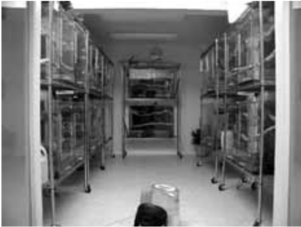
Facility for housing Emerald Tree Boas showing tall cages with large openings that allow ready access for maintenance. Note the humidifier in the foreground; controlling the environment of an entire room precludes the duplication of control mechanisms for each enclosure.

refined techniques for the maintenance of precise atmospheric conditions in greenhouses, and these same strategies can be successfully applied to housing C. caninus .