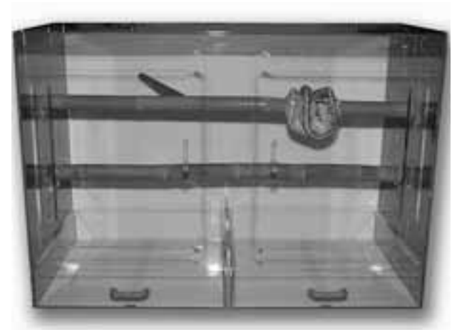
Minimalist enclosures appropriately emphasize the inhabitant.