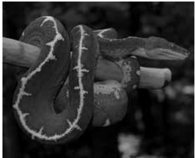
Adult male Corallus caninus demonstrating the color and "personality" that causes these snakes to be so prized by hobbyists.

Depending on the nature of the facility, minimalist habitats within environmentally controlled rooms may consist of as little as two perches and a water source. Although such setups have proven ideal and are commonly parts of larger collections, the majority of herpetoculturists employ environmentally independent self-contained habitats. Such units require additional hardware to achieve and sustain the continuous levels of temperature and humidity necessary to maintain Neotropical