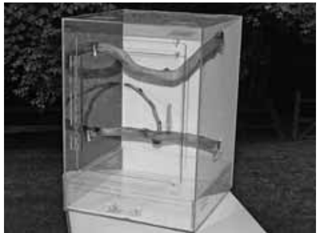
Easily modified, lightweight plastic enclosures with perches at several heights facilitate maintenance of proper temperature and humidity.