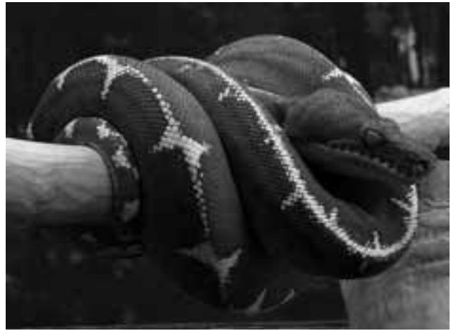
Adult male Corallus caninus showing the slit pupils associated with nocturnal activity, the heat-sensitive pits that locate prey and direct strikes even in the absence of light, and the characteristic posture assumed by Emerald Tree Boas.

Whereas aesthetic considerations will influence the selection of cage furnishings to some degree, the most ergonomically efficient minimalist designs require less of virtually everything. Focusing on the inhabitant as the primary attraction and minimizing the number of decorative items will minimize maintenance time and allow for greater budget flexibility, especially when considering larger colonies.