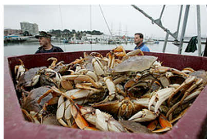
Alaskan King Crabs

We got a deal on diesel fuel the other day for $4.29 a gallon but have paid as much as $5.54 in Canada, or $1.59 a liter. With the Alaskan pipe line providing 1/3 of the fuel for this country you would think it would be cheaper.