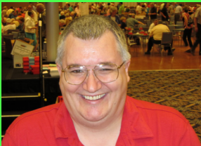
Bridge by the Freeway editor: Bruce McIntyre (Burnaby BC)

Bridge by the Freeway is the Daily Bulletin of the 2014 Puget Sound Regional, held in Lynnwood WA, just north of Seattle. The tournament site is the Lynnwood Convention Center, at 196th St SW and 36th Ave W, just west of Exit 181 (southbound) or 181B (northbound) from I-5, a few blocks east of Lynnwood's commercial center and a few blocks southwest of the Alderwood Mall.