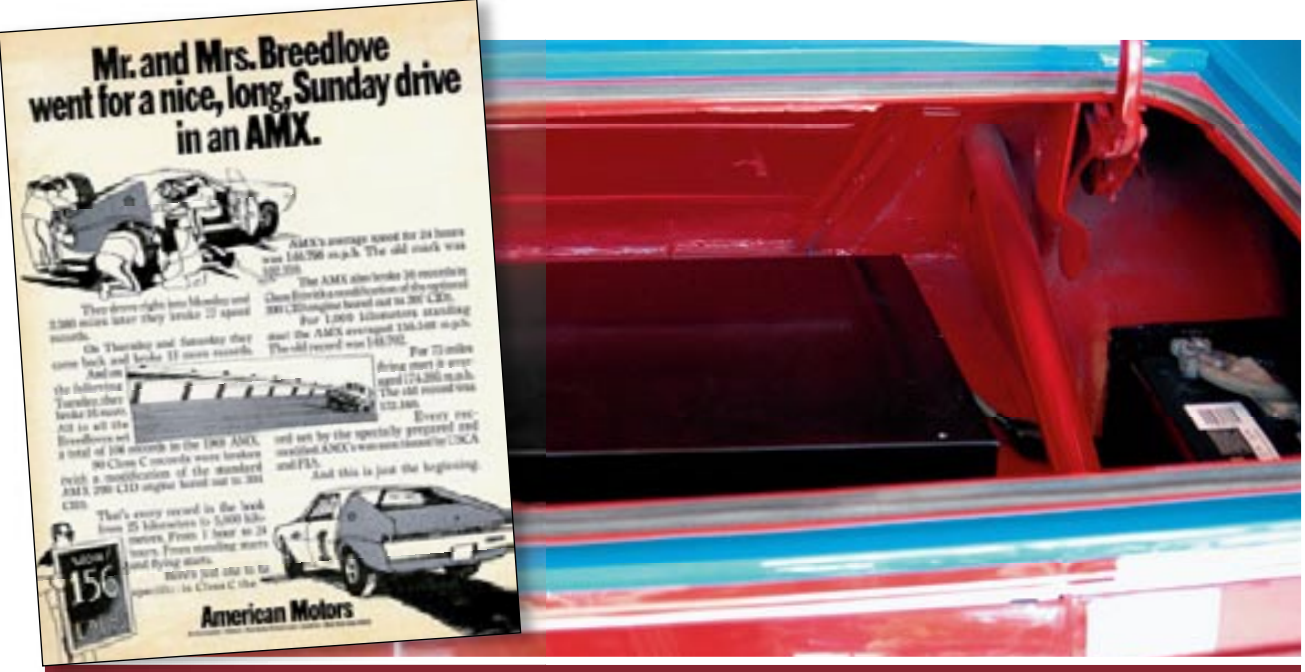
AMC got plenty of advertising mileage out of the Breedloves' record runs.