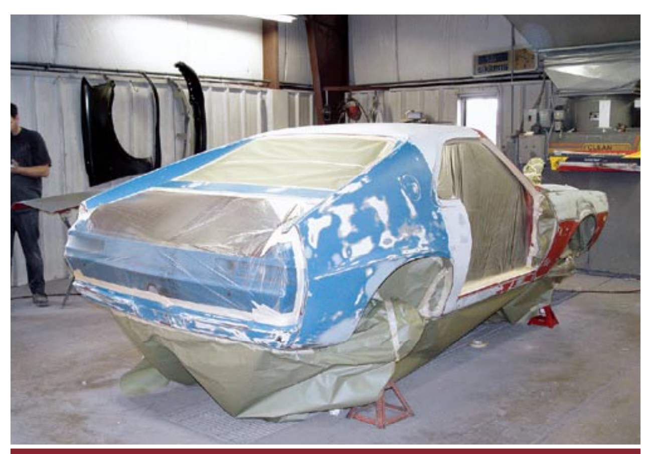
Breedlove AMX undergoing restoration.