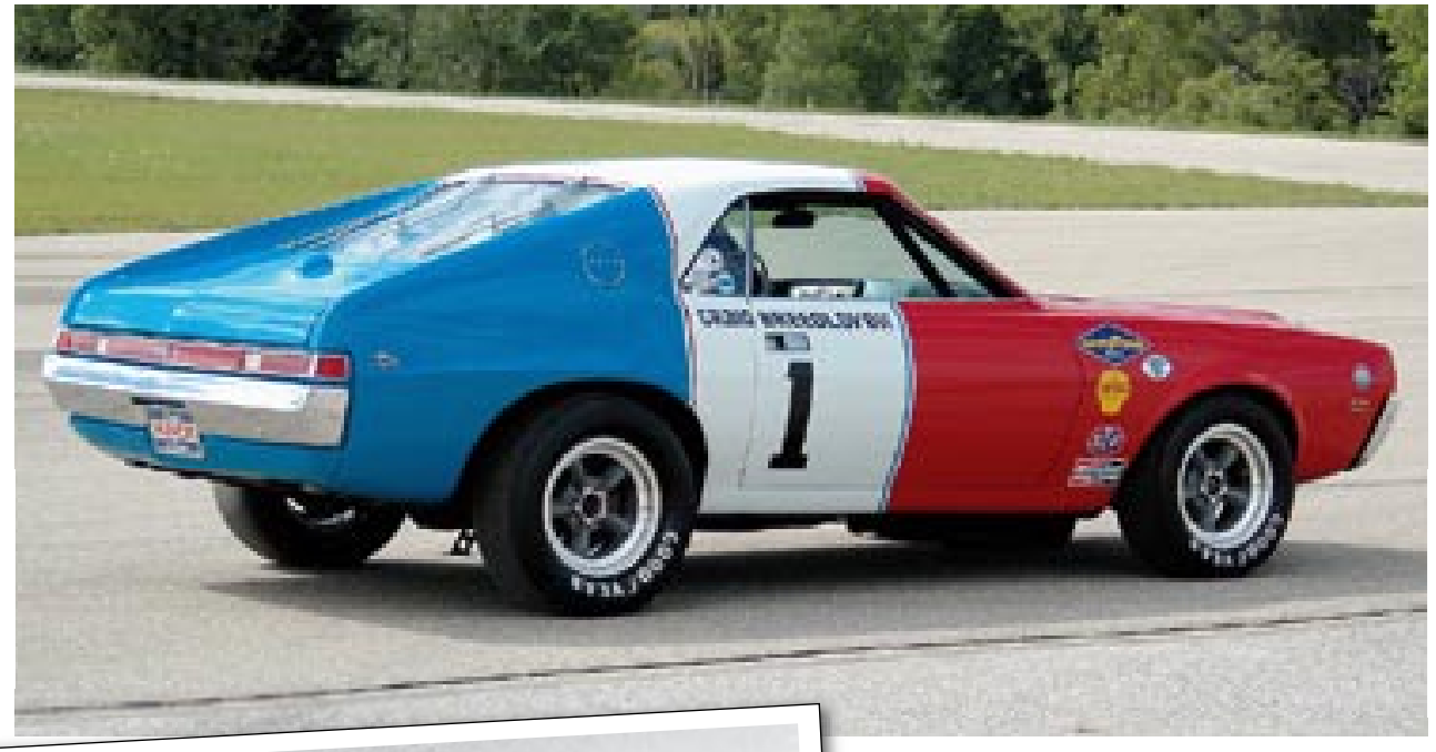
No. 1 car, at speed at the San Angelo track.

(at the time they were the only other American two-seaters besides the Corvette), but most enthusiasts realize that these cars are now exactly where they belong.