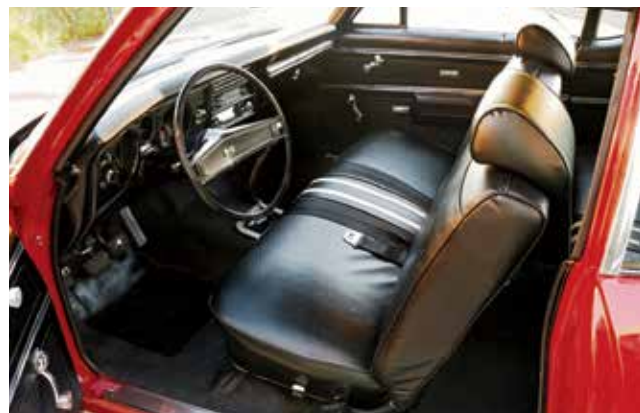
■ No bucket seats or even Astro ventilation here. The base 300 Deluxe Chevelles were equipped with bench seats like a taxi cab—Chevrolet even scrimped on the amount of foam in the seat cushion!—rubber floor mats, and vent windows.