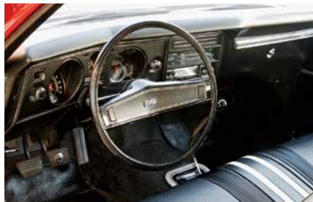
■ The instrumentation, too, is in keeping with the car’s base-level equipment. There’s no console on the floor either, but that’s a Hurst shifter coming out of the hole in the floor, likely added when the original owner swapped transmissions.