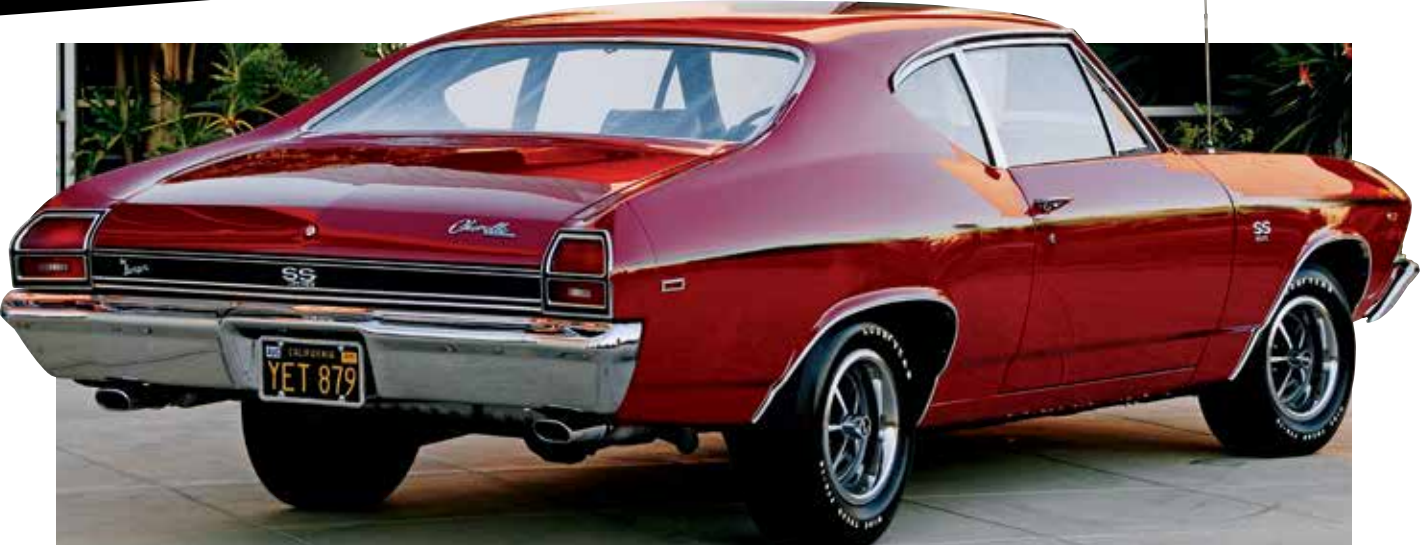
■ Two-door sedans (or “post” cars) weren’t made in the same volume as hardtops back in the classic muscle era, but they were structurally stronger (and usually lighter), making them good platforms for performance. Dave Lindsley’s Chevelle, a base 300 Deluxe model with the Super Sport option, is rare still.