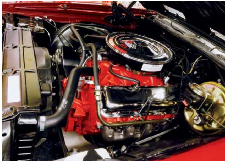
■ Most base Chevelles were fitted with six-cylinder or economically minded V-8 engines. A handful, like this one, got a big-block V-8 backed by a three-speed heavy-duty manual transmission. The car’s original owner swapped the three-speed for a four-speed and took it drag racing.