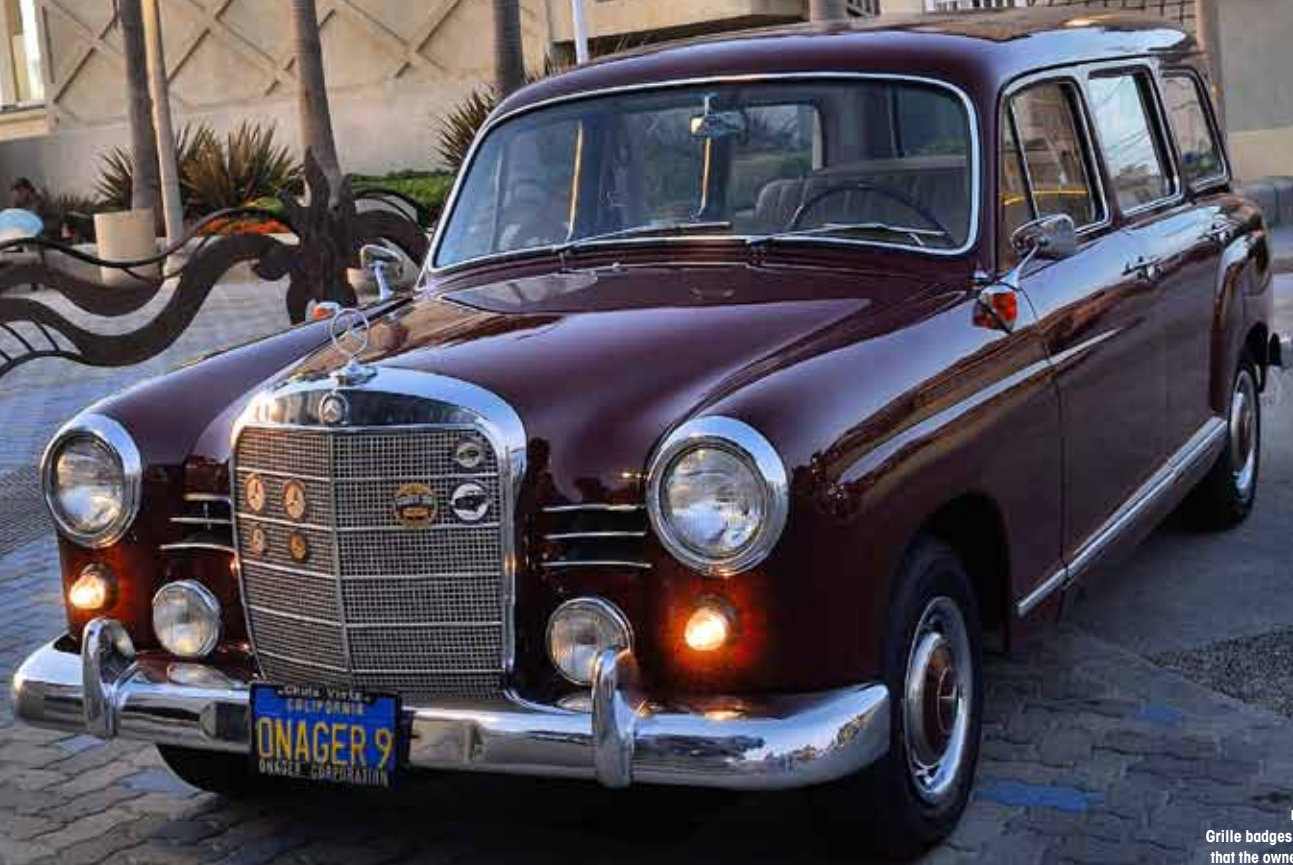
BELOW Grille badges show that the owner is a Mercedes club man.