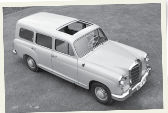
A contemporary photo of the Binz project, from the Mercedes-Benz archive.

infestation, was another matter, but not an insurmountable one. As Binz used non Mercedes materials to trim the interior, it was redone in 1980s factory vinyl. This turned out to be a perfect match for the colour and texture of the original material. Other trim components were sourced from Mercedes-Benz models of the period. Gunthorp pointed out that the interior lights are from the 300 series cars, which is why the light switch on the dash is chrome instead of black plastic.