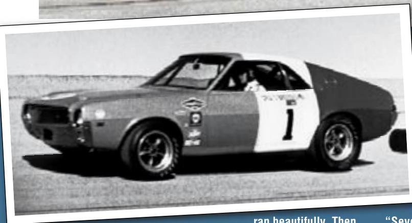
No. 1 car, at speed at the San Angelo track.

500 feet around the inside of the track and placed every available car at points along the five miles to help illuminate the way with their headlights. After I came in for my next pit stop we decided to change batteries at each stop through the night instead of replacing the alternator. The battery changes meant slower speeds, but in the end we still averaged 140.790 mph, covered 3,380 miles in the C car in 24 hours and along the way established 90 new records, at distances from 25 to 5,000 kilometers.