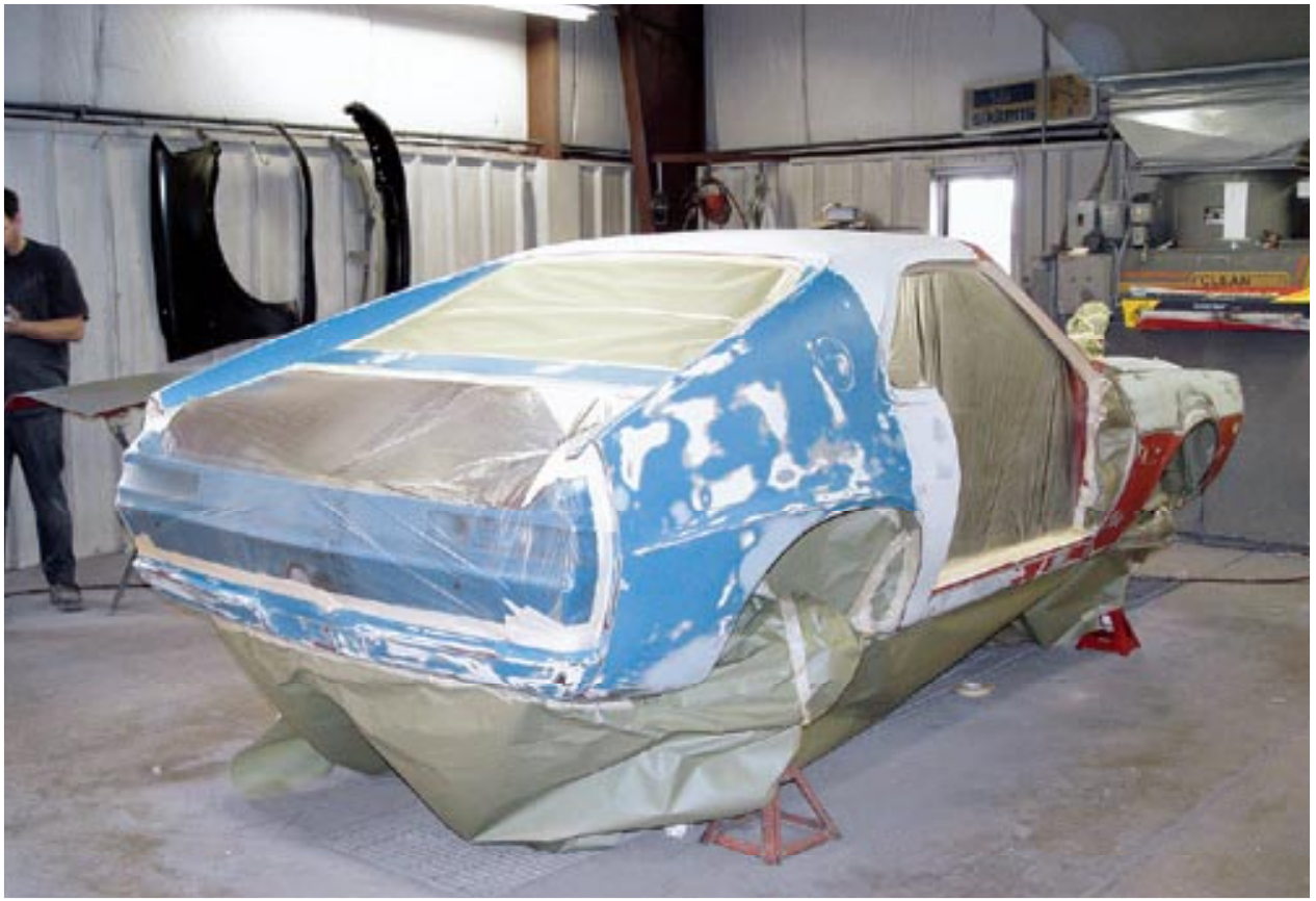
Breedlove AMX undergoing restoration.