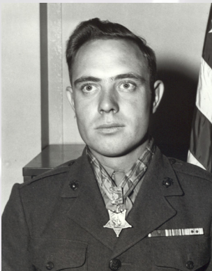
CWO Hershel W. Williams (USMC Ret.)

MEDAL OF HONOR RECIPIENTS SHARE THEIR STORIES OF HEROISM AND PERSEVERANCE