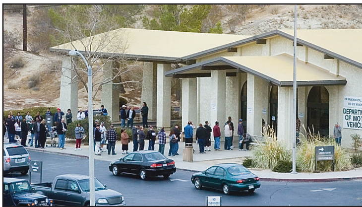
Department of Motor Vehicles customers line up early, before the office opens in Victorville. The office may be due for major expansion.