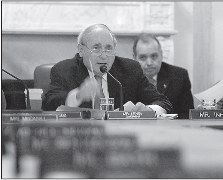
Senate Armed Services Committee Sen. Carl Levin, D-Mich., chairs a hearing on Capitol Hill in Washington on Friday on the Pentagon's planning prior to the Iraq War.

He said, "Under the circumstances and given the attention