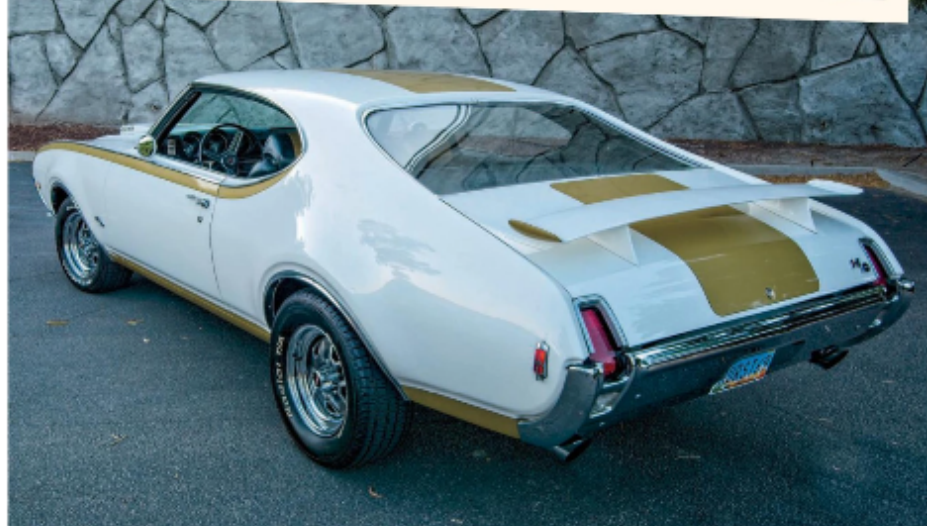
■ With its Cameo White paint and Firefrost Gold stripes, the 1969 Hurst/Olds looks very different from the understated black and Peruvian Silver paint scheme of the 1968 version. Yet the bold look remains classic, now five decades on.