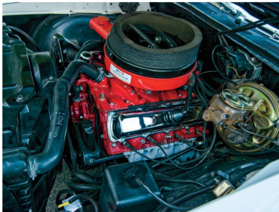
■ The 455ci V-8 under the hood was not offered in regular-production, midsize Oldsmobiles in 1969, just the Hurst-built cars. GM wouldn't relax that engine-size rule for another model year. The 455 produced 380 hp and 500 lb-ft of torque, which propelled the 3,965-pound car down the quarter-mile in 14.21 seconds at 99.66 mph, according to Hot Rod magazine.

Tires: 225/60R15 front, 255/60R15 rear BFGoodrich Rival T/A