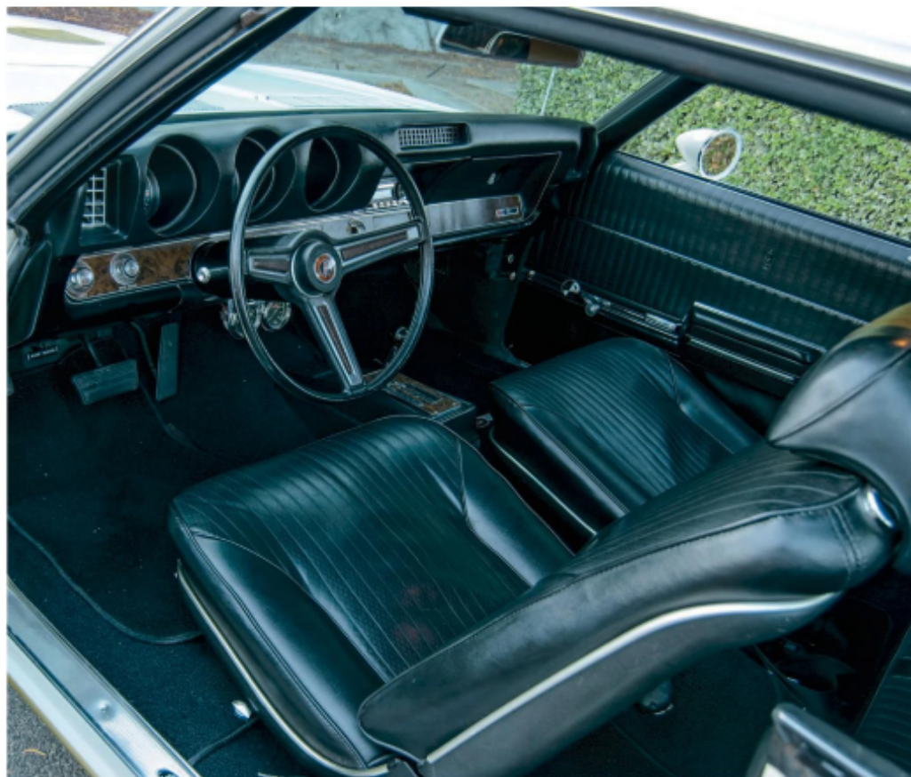
■ Subtle modifications differentiated the Hurst/Olds, including gold stripes on the headrests and the Hurst/Olds badge on the glovebox.

The rest of the story is similar to that of