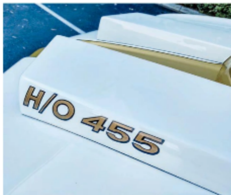
■ The on-hood graphics and mailbox-size scoops left nothing to the imagination.