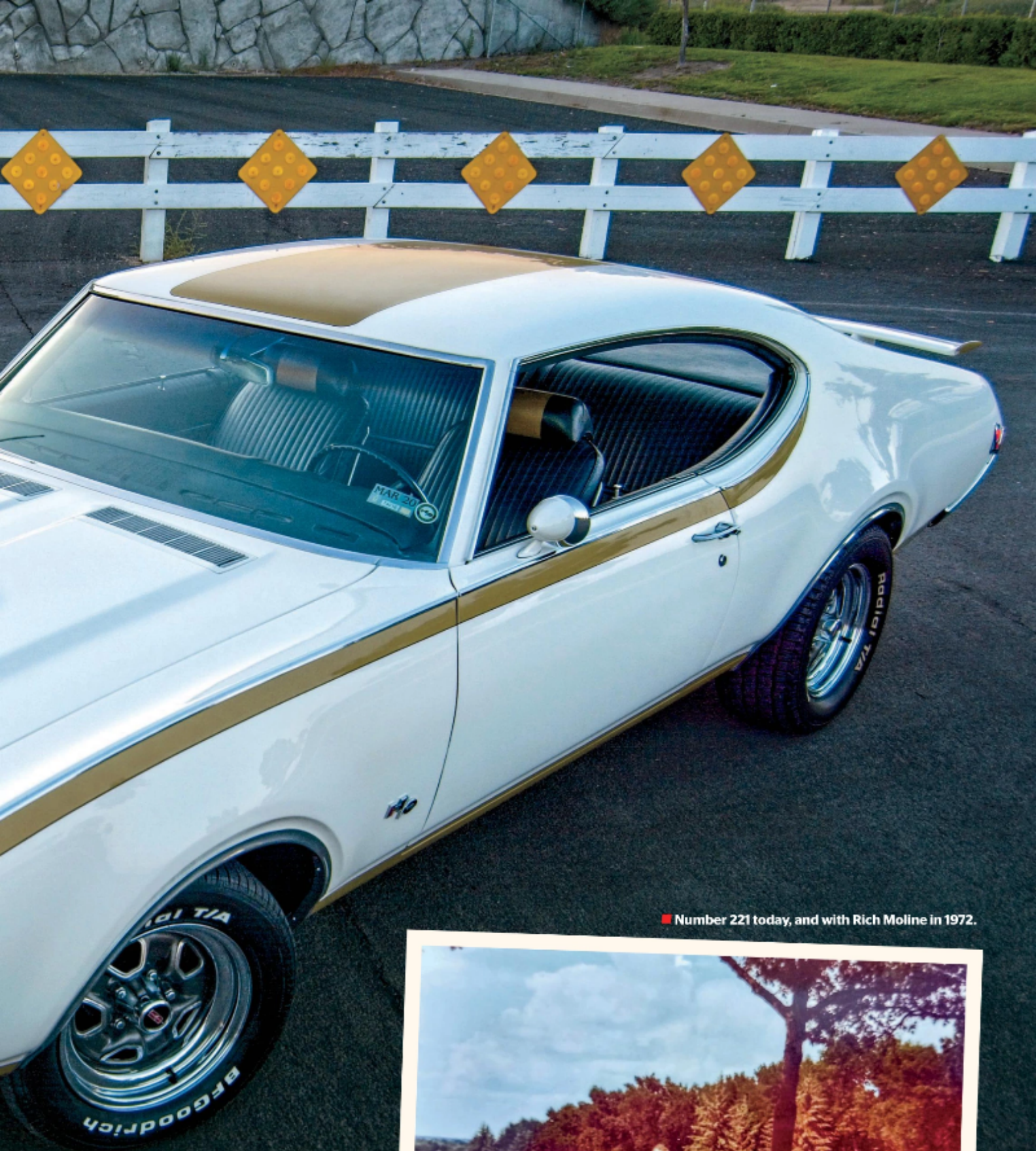
■ Number 221 today, and with Rich Moline in 1972.